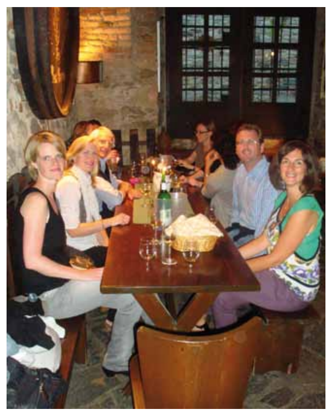
Wine Tasting in Dürnstein